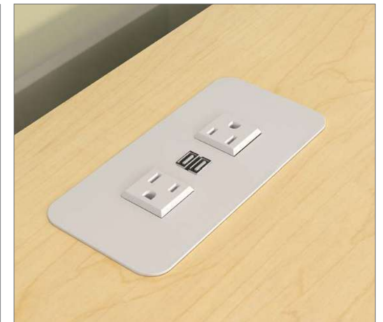
Power, data, and video connections can be brought to the worksurface using pass-through grommets or desk-mounted electrical grommets.