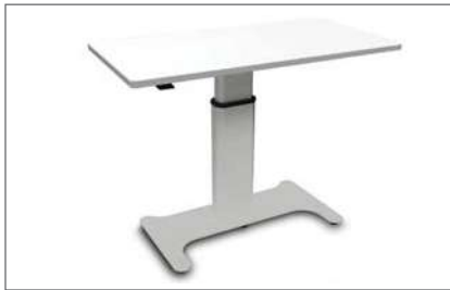
Type C H-Base: available in pneumatic, 3 finishes.