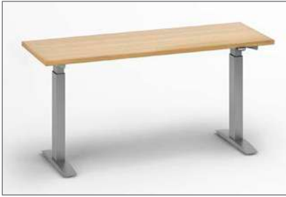
Type A: available in electric or pneumatic, 2- or 3-leg setups, 12 finishes, Made in USA.