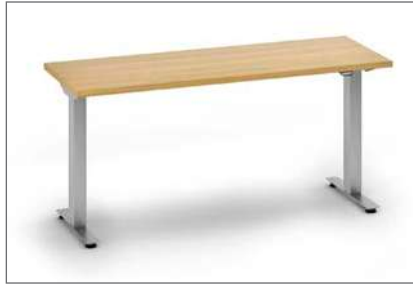
Type B: available in electric, 2-leg setups, three finishes. Made in USA.