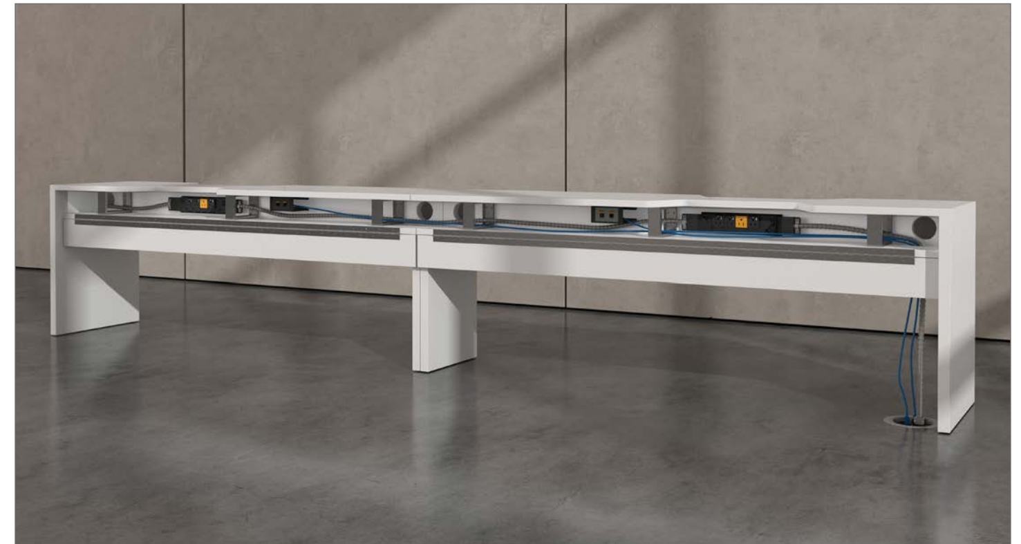
Power and data cables are neatly tucked away inside the trough and are easily accessible via a piano-hinged door.