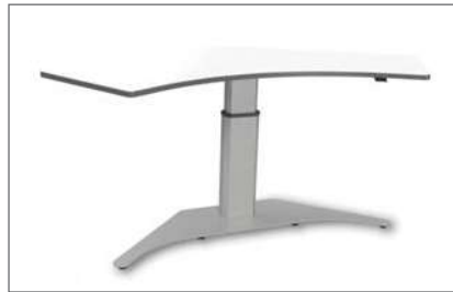
Type D wing-base: available in pneumatic, 3 finishes.