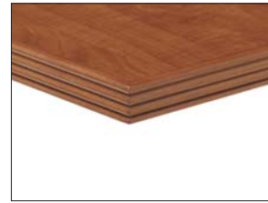
B2 (3/8" wood)