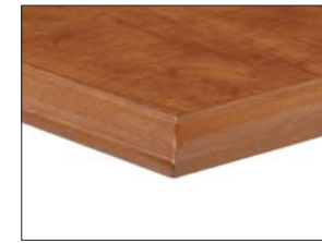
C3 (1-1/8" wood)