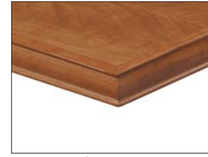
B3 (3/8" wood)