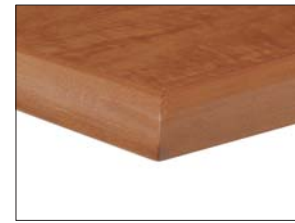
D2 (2" wood)