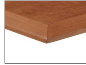
C1 (1-1/8" wood)