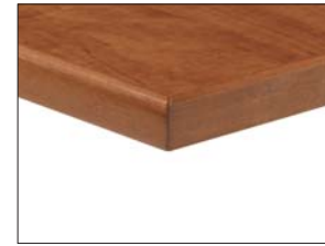
B1 (3/8" wood)