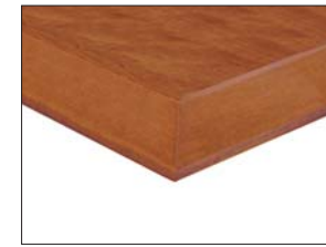
D1 (2" wood)