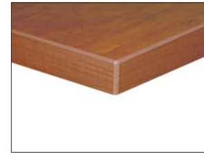
A1 (2mm PVC)